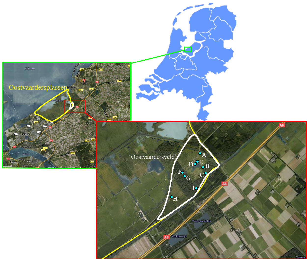
Figure 1. The study area, Oostvaardersveld, where nine traps were placed.